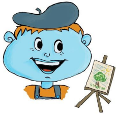
Engage and Persist