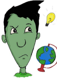
Stretch and Explore