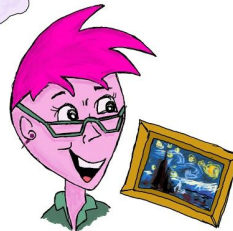
Understanding the Art World